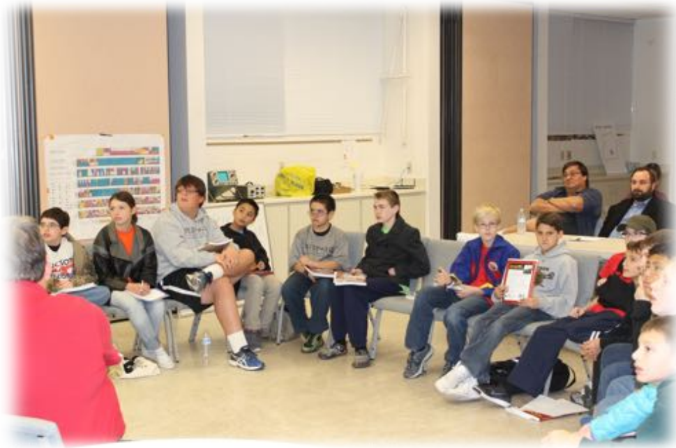
Classes at WN7BSA