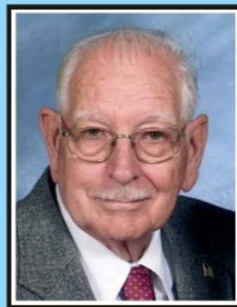
December 17, 1930 - March 8, 2023 92 Years Old

He is very sadly missed by all whose lives he touched as well as his family.