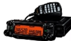
Yaesu FTM150RASP-55/50W 144/430MHz FM Dual Band Mobile Transceiver

MORE SPACE, MORE FUN! We've expanded this year-plenty of room for everyone! Join us for Presentations, VE Testing, GOTA station and more!